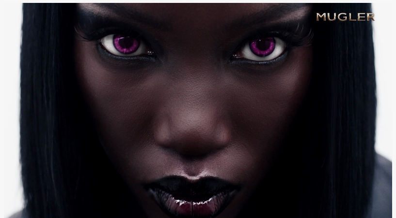
Best Editing / Post & Best VFX / CGI / Animation: : "Alien Hypersense", Mugler