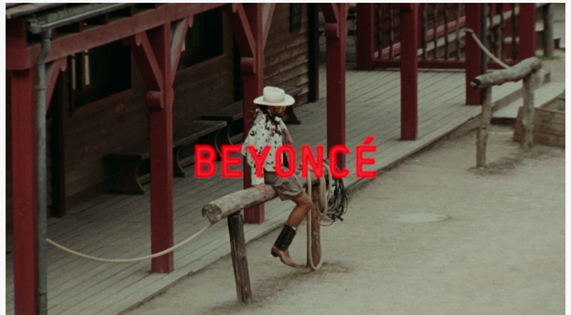
Best Art Direction & Best Sound Design / Use of Music: "Beyoncé - Club Cowboy Berlin", Columbia Records