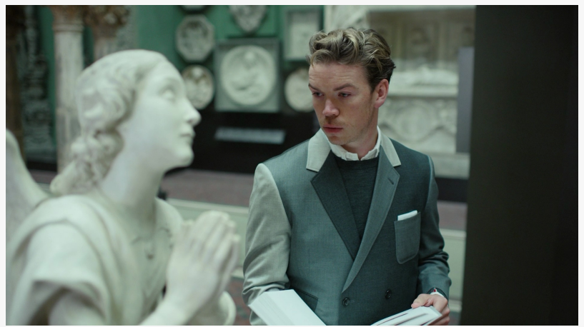
Best Direction: "Night at the Museum", Thom Browne

10. Best Sound Design / Use of Music: "Beyoncé - Club Cowboy Berlin"