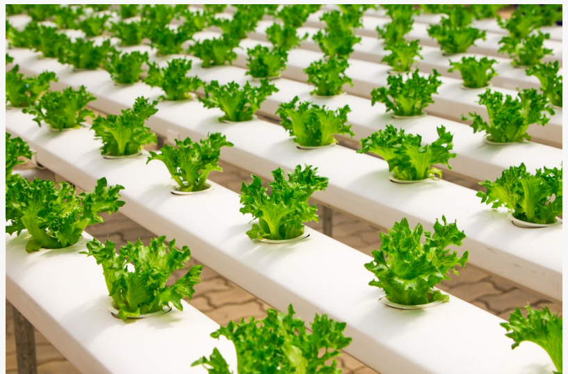
Using Technology in Agriculture