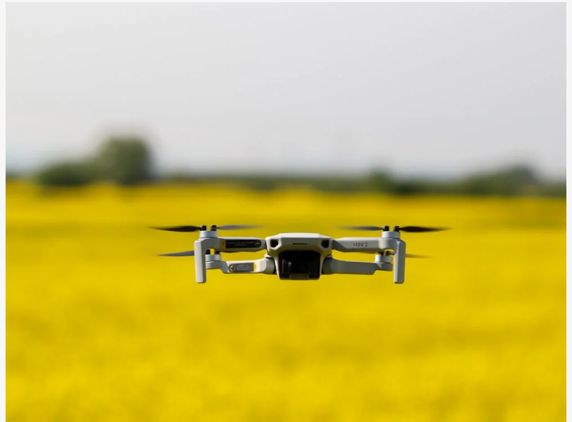
Technology in Agriculture