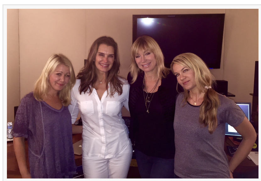
Brooke Shields with the producers of WHEN THE BOUGH BREAKS