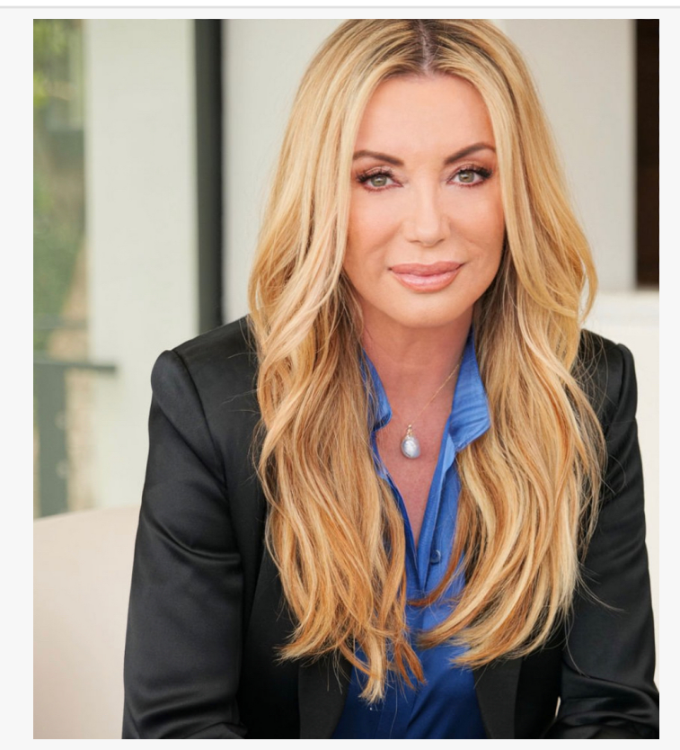
Producer and Co-Creator of WHEN THE BOUGH BREAKS