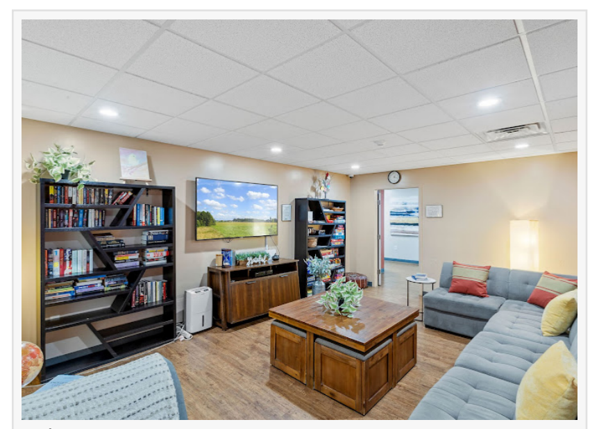
Soba New Jersey Interior

Consultations and Assessments: Get started with personalized consultations and in-depth assessments to create a tailored treatment plan.