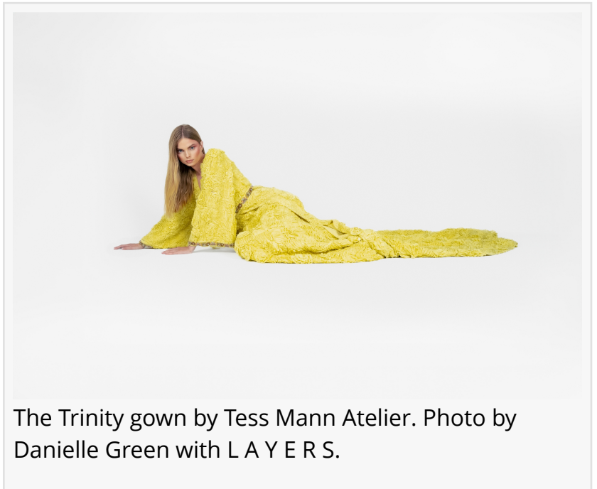
The Trinity gown by Tess Mann Atelier.

NASHVILLE, TN, UNITED STATES, December 2, 2024 /EINPresswire.com/ -- Following successful showcases across major international fashion weeks, Tess Mann Atelier (TMA) announces a transformative shift in its approach to fashion, moving away from traditional seasonal collections to embrace a more sustainable, seasonless model.