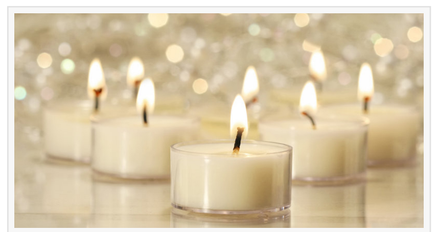
In 2024, no one is likely thinking about how and when Christmas became the rejoiced holiday that it is ... but what if God has communicated with a person about Christmas?

In 2024, no one is likely thinking about how and when Christmas became the