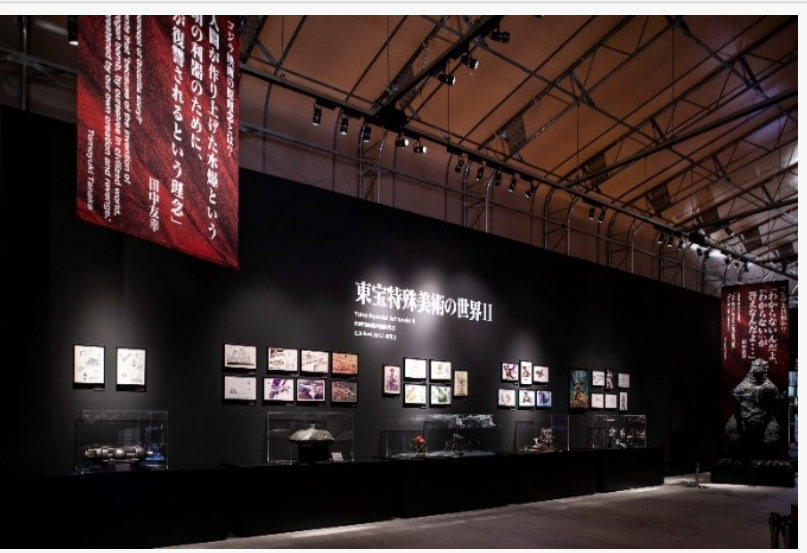
Inside the Godzilla Museum

An extensive range of Godzilla merchandise is also on offer at Godzilla Interception Operation, many of which are original designs found exclusively at Nijigen no Mori. Visitors will also find