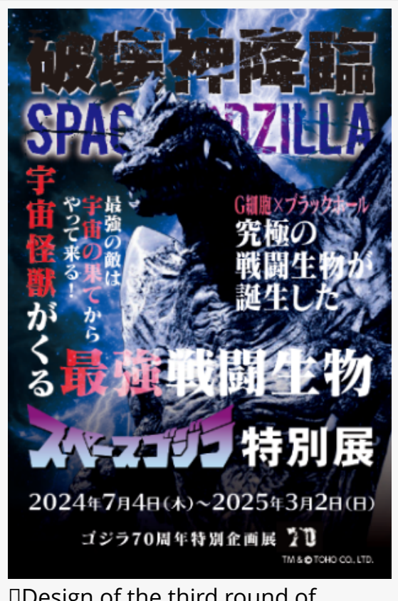
Design of the third round of original postcards

From Monday, December 7th, the third round of original design postcards will be launched as a bonus