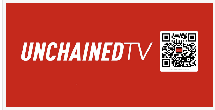
UnchainedTV is your portal to a healthier, kinder, low-carbon footprint lifestyle

This press release can be viewed online at: https://www.einpresswire.com/article/765134614