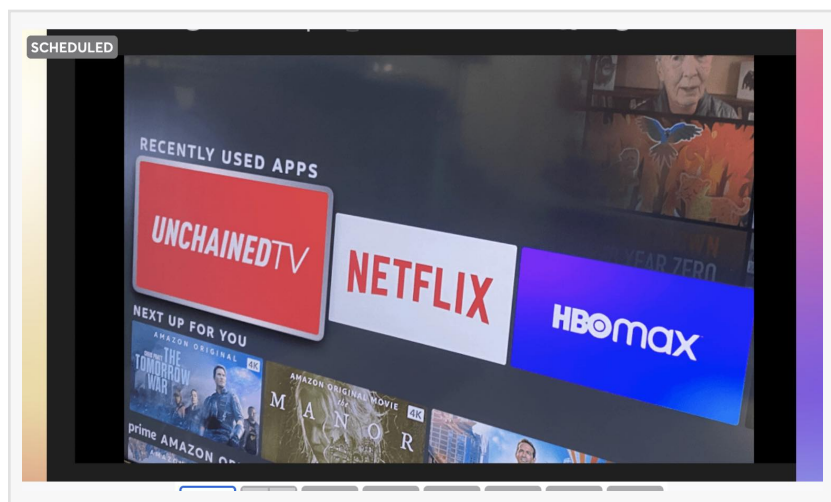
Download UnchainedTV for FREE on your TV via streaming devices or SmartTVs.