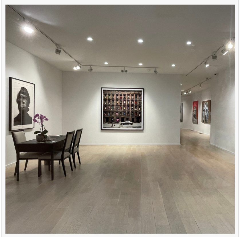
Contessa Gallery | Southampton, NY

Join Us at Art Miami BOOTHS 540 | 541 | 542