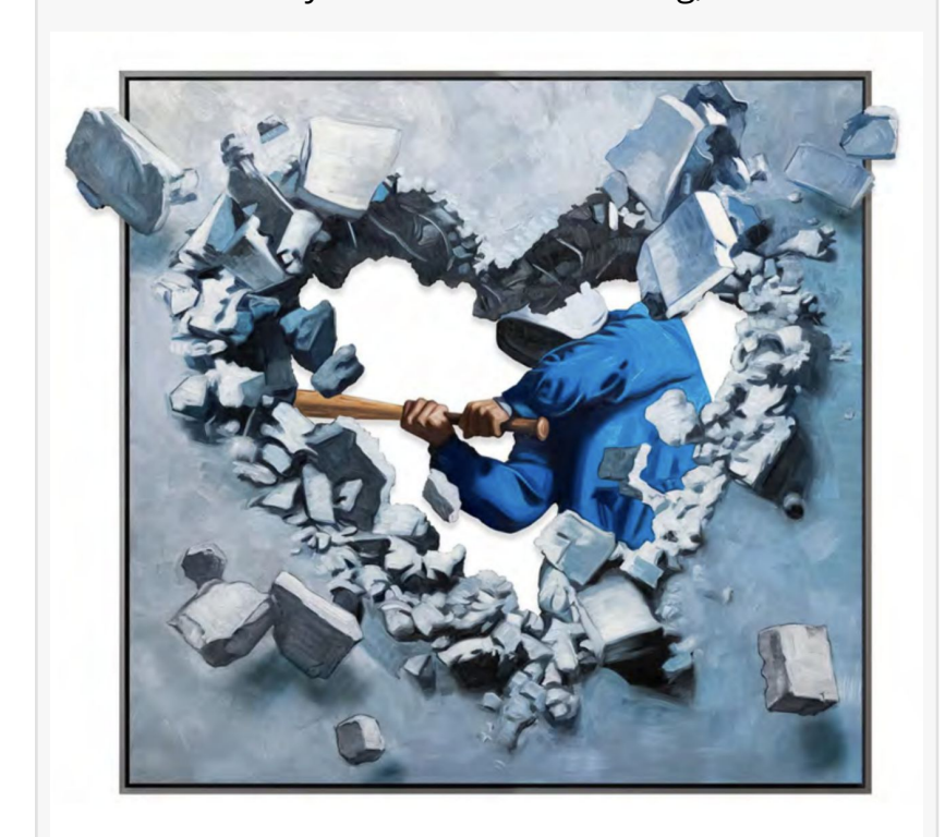
Contessa Gallery - Hijack "Heart Of Stone, 2024"

This press release can be viewed online at: https://www.einpresswire.com/article/764684380