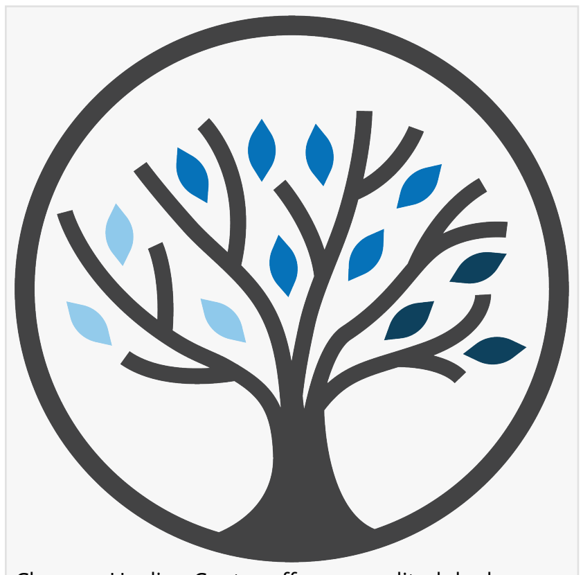
Changes Healing Center offers accredited dual diagnosis and addiction treatment

"Our mission is to break down barriers to addiction recovery," said a spokesperson for Changes Healing Center. "Changes understands that access to quality treatment is crucial, which is why we accept multiple insurance options, including AHCCCS and many other insurances, to ensure that comprehensive care is within reach for Arizona residents."