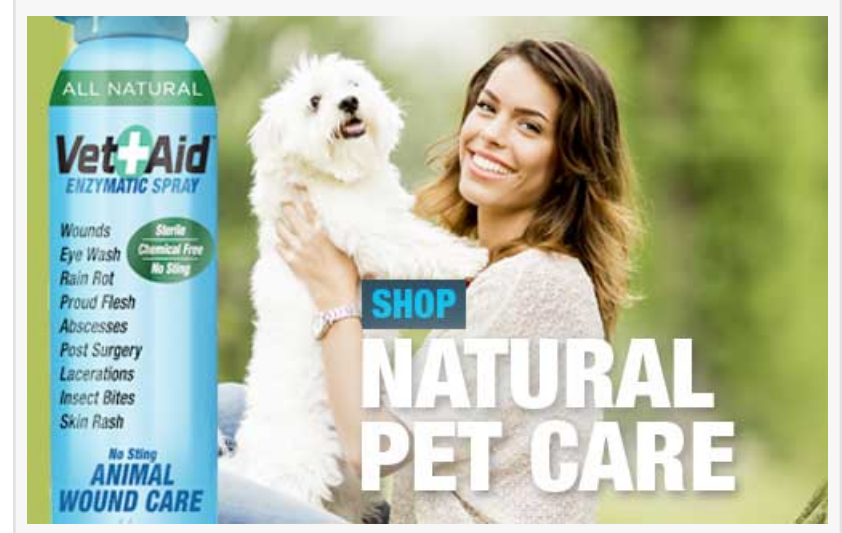
Best Natural Sea Salt Based Vet Products made with Minerals, and Enzymes.

This press release can be viewed online at: https://www.einpresswire.com/article/764276246