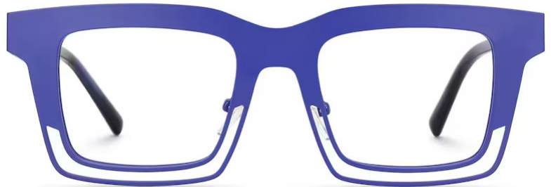
men frame glasses