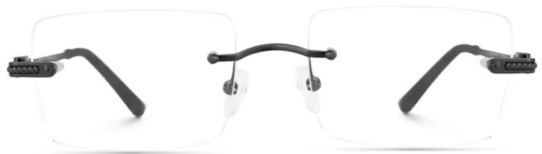
men rimless glasses