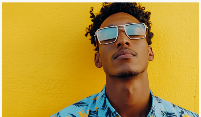
Rectangle Metal Eyeglasses for Men

One of the key factors to consider when choosing eyeglass frames is the