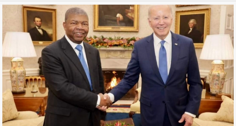
2023 Meeting between US President Joe Biden and President João Lourenço of Angola