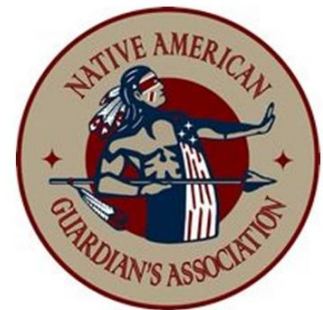
NAGA & IAOVCA Solidarity Sessions - Bridging Cultures Against Cancel Culture