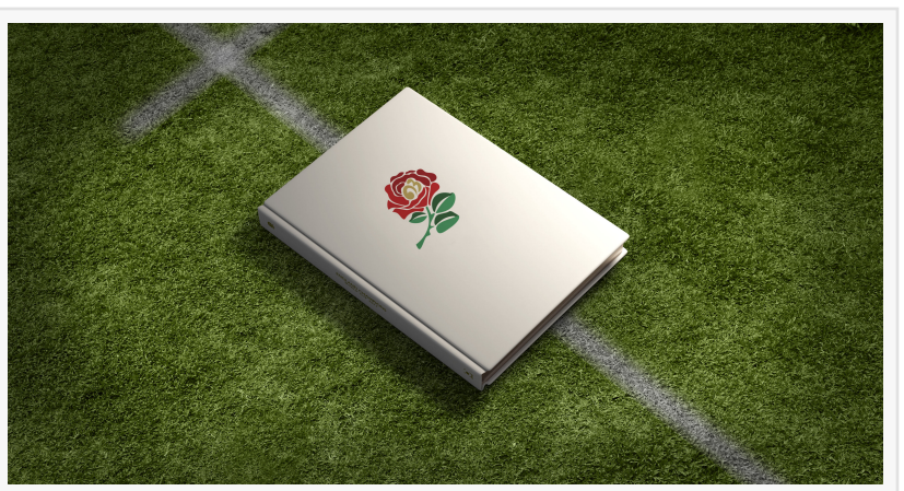
For the first time ever all 31 players of the England 2003 Rugby World Cup squad have teamed up with OPUS to create the definitive Opus Limited Edition to celebrate their historic win in 2003.

playing catch-up despite opening the scoring through wing Lote Tugiri. The match represented the culmination of four impressive years of improvement from an England team determined to prevent Australia from retaining the world cup. Jonny Wilkinson silenced the strong home support with three penalties. The constant rain were conditions that England were happy to contend with and with both sides choosing to keep the ball in hand England found the edge they needed to dominate. Towering performances from many areas on the pitch saw England create problems for the Wallabies. But just as England looked likely to pull away the Aussies punished them by scoring two penalties for sloppy play in quick succession to bring them back to touching distance. As the referee prepared to blow for full time, Flatley slotted his third kick of the half to push the match into extra time. With strong leadership on the field England concentrated on the minutes of play ahead of them rather than dwell on those that had just passed. England played with confidence and found themselves in a position they knew all too well which was six years in the