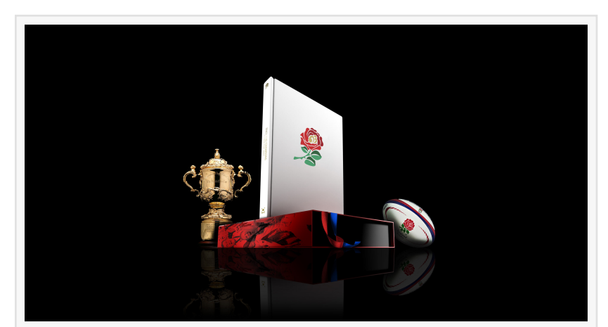
The Opus tells the story of England's triumph on an epic scale. The Limited Marquee Champions Edition each featuring a specially designed signature page that is hand-signed by all 31 players.

LONDON, UNITED KINGDOM, December 3, 2024 /EINPresswire.com/ -- OPUS today announce on the 21st year anniversary month of England winning the world cup, the forthcoming publication of The England Champions Opus.