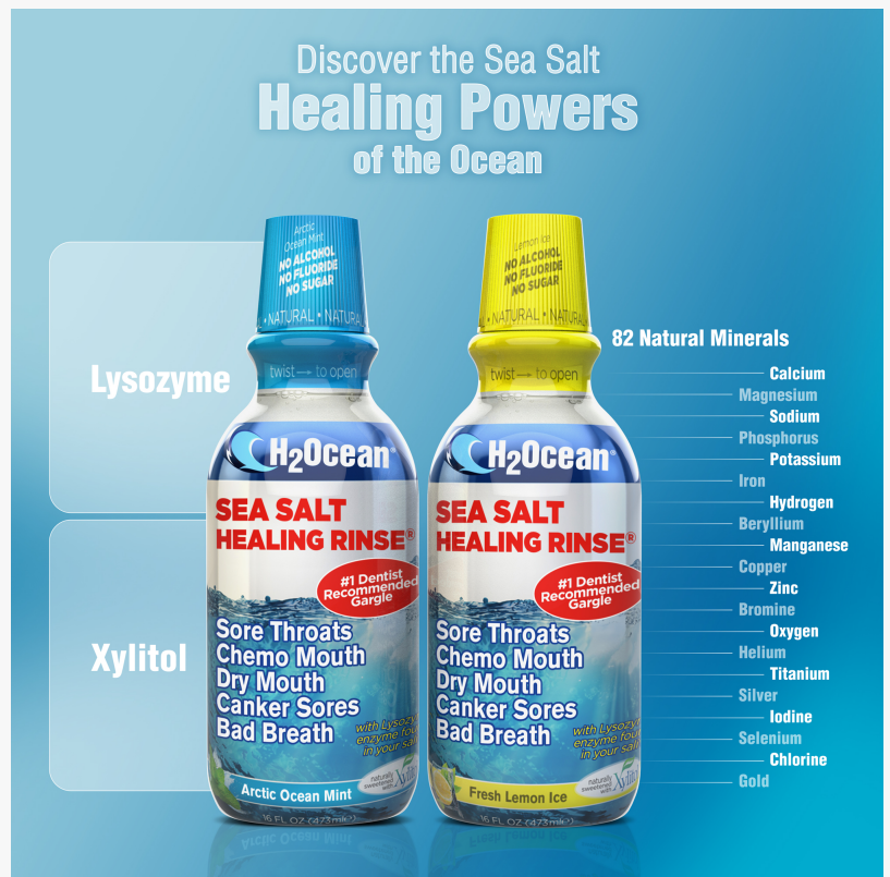
H2Ocean Healing Rinse Sea Salt Mouthwash