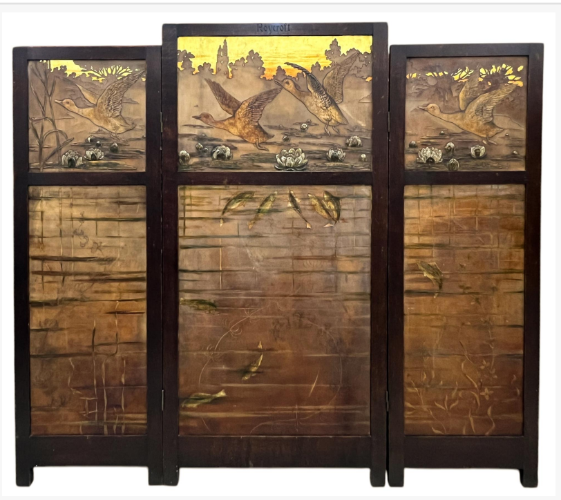
Roycroft special hand-modeled leather panel screen, 71 inches by 80 inches, one of the most important pieces of Roycroft furniture in existence, museumquality (est. $20,000-$40,000).

The online-only auction will start at 5pm Pacific time, with online bidding available through the MBA Seattle Auction House website