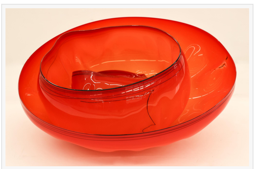
Large three-piece suite with black lip wraps by master glass blower Dale Chihuly, titled Fire Red Basket Set (1993-94). The set is in excellent condition. Box not included (est. $10,000-$20,000).

A watercolor on Arches paper by Paul Jenkins (N.Y., 1923-2012), titled Phenomena Greeting the Winds (1980),