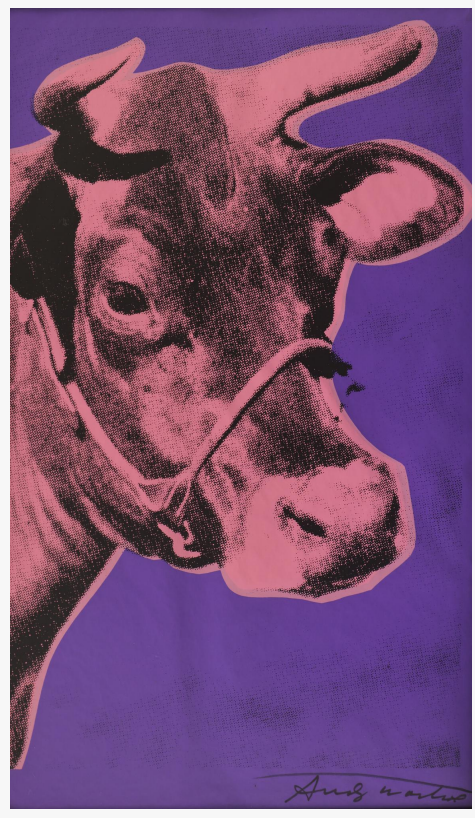
Andy Warhol's iconic Cow (F.&S. II 12A), a 1976 screenprint on wallpaper sheet measuring 45 ½ inches by 28 inches, signed lower left and numbered 25 of 100 (est. $7,500-$15,000).