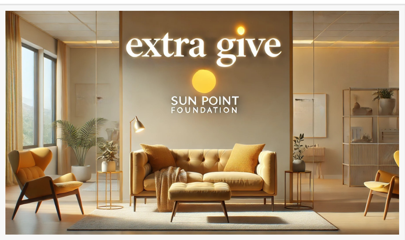
Sun Point Foundation Awarded Equity Award

LANCASTER, PA, UNITED STATES, November 22, 2024 / EINPresswire.com/ -- Sun Point Foundation, a Lancaster nonprofit counseling agency committed to providing accessible, high-quality therapy, is proud to announce it has been awarded the prestigious Pursuit of Equity award. This recognition celebrates organizations that are intentionally advancing equity through innovative policies and programs, with a focus on uplifting BIPOC and LGBTQ+ communities.