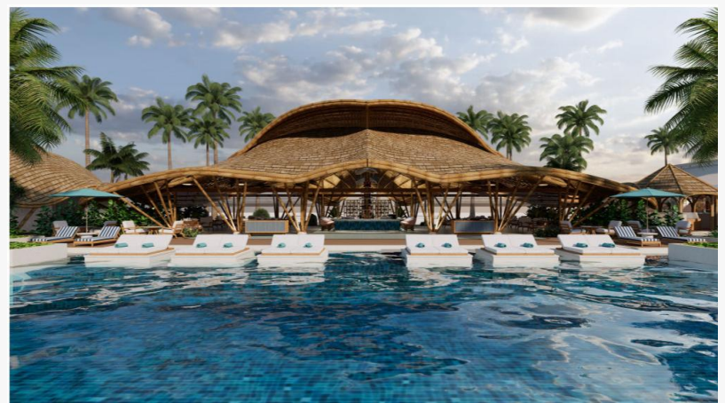
SIX & SIX Private Islands will lead on design and experience