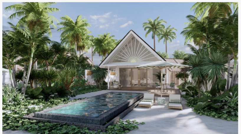
SIX & SIX Private Islands will offer opulent luxury villas overwater and on the beach