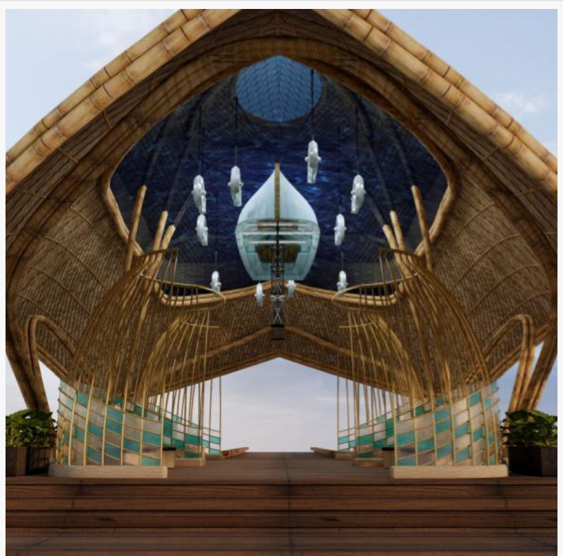
SIX & SIX Private Islands will lead on design and experience

Marc Gussing SIX & SIX Private Islands marc@sixandsix.com