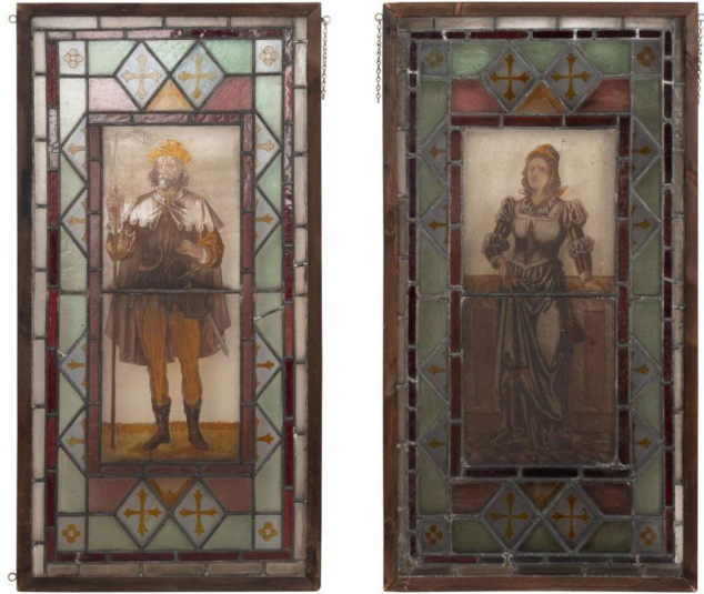
Pair of circa-1870 Gothic Revival leaded figural polychrome painted and stained glass window panels, made in the manner of Augustus Welby Northmore Pugin (English, 1812-1852) ($3,328).

Next up for Ahlers & Ogletree is a Modern Art & Design auction scheduled for Wednesday, December 4th, followed by a Winter Jewelry, Watches & Luxury Accessories auction the very next day, Thursday, December 5th. Both will be held online and live in the Atlanta gallery located at 1788 Ellsworth Industrial Boulevard NW. Watch the website for more info as the sale dates approach.