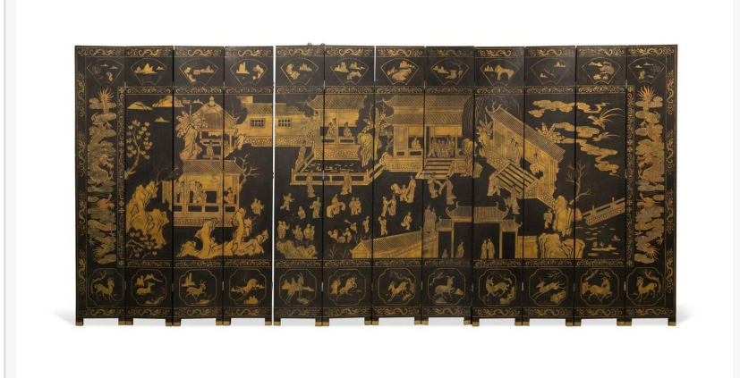
Chinese 12-panel coromandel lacquer floor screen with carved decoration on two sides, the front side depicting parcel-gilt pavilions and court scenes surrounded by exotic animals ($3,932).