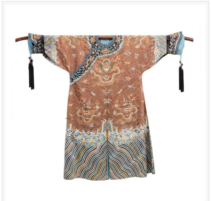
Chinese embroidered silk dragon robe, likely Qing Dynasty, depicting three four-clawed dragons with flaming pearls, amongst emblems of the Eight Buddhist Treasures, on a brown ground ($16,577).

The gorgeous Chinese embroidered silk dragon robe depicted three four-clawed dragons with flaming pearls, amongst emblems of the Eight Buddhist Treasures, on a brown ground above wave patterns. The robe, likely dating to the Qing Dynasty (1636-1911), measured 55 inches in height. It came into the auction with a $1,500-$2,500 estimate, but its $16,577 finish made it the sale's runner-up top lot.