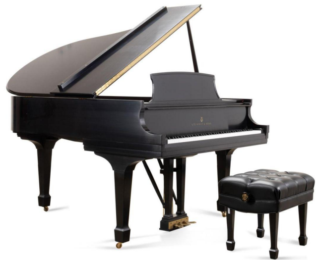
1997 Steinway Model M ebony baby grand piano with the maker's mark and serial number 548420 to the metal plate, having spade legs and accompanied by a Jansen tufted artist bench ($20,570).