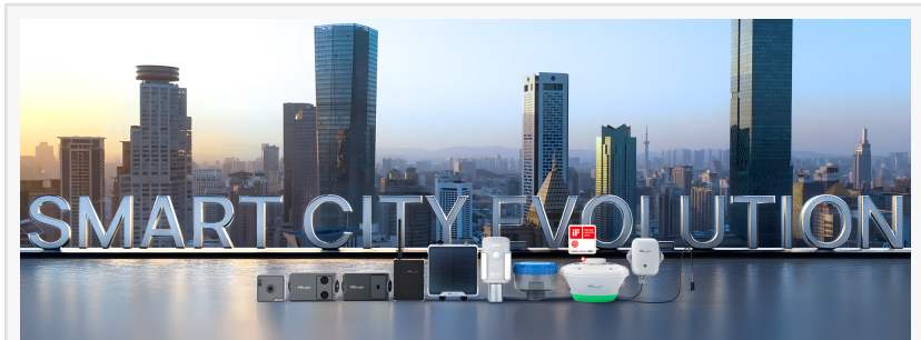
Milesight Smart City Evolution

Milesight's IoT technology empowers cities to better manage public assets, resources, spaces, safety, and environmental factors, all while supporting sustainability goals. By integrating advanced smart sensors, urban centers can monitor critical infrastructure in real time, predict potential issues, and ensure that public services run seamlessly.