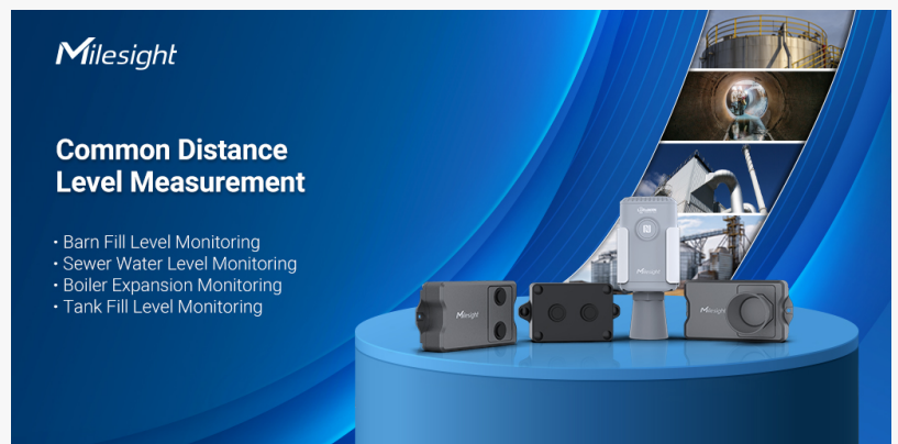
Smart City Water Level Measurement