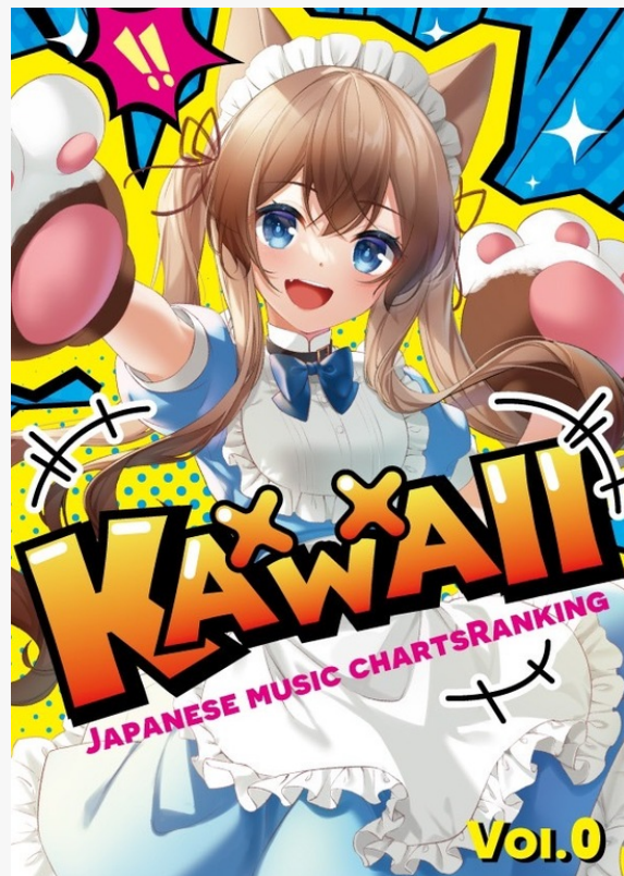
KAWAII Magazine Vol.0