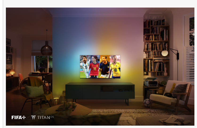
Fifa x Titan OS Set Up

With the launch of the FIFA+ channel, football fans across the continent will be able to enjoy a first-class viewing experience right in their living rooms, with a selection of live matches, full match replays, documentaries, original series and exclusive content that offers an in-depth look at the world of football. From historic FIFA World Cup and FIFA Women's World Cup moments to specially curated match highlights.