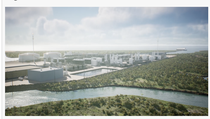
Argent LNG Back