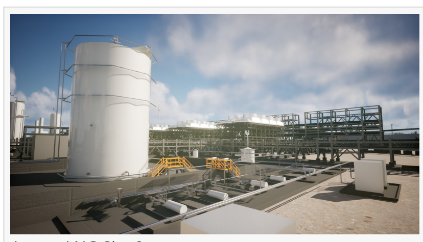
Argent LNG Site 2

This press release can be viewed online at: https://www.einpresswire.com/article/762045950