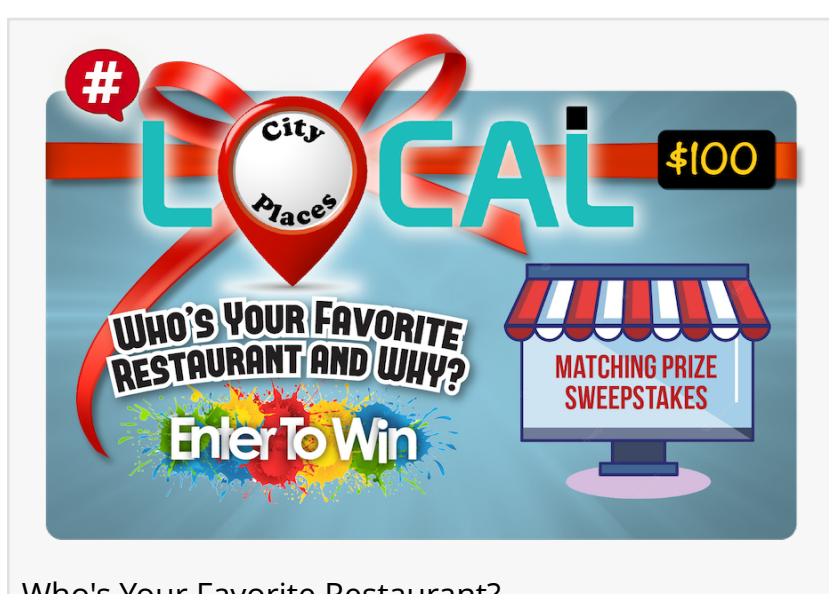
Who's Your Favorite Restaurant?

CHANDLER, AZ, UNITED STATES, November 19, 2024 / EINPresswire.com/ -- LOCAL City Places, a leading local search platform dedicated to providing users with the most comprehensive, up-to-date information about everything their city has to offer, is excited to announce the company is embarking on Phase II of its national rollout.