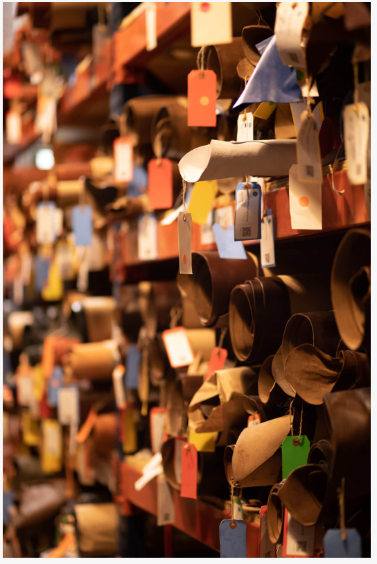
Leather Sides & Bundles on Sale

Any order placed after Dec 19 will be shipped in the new year.