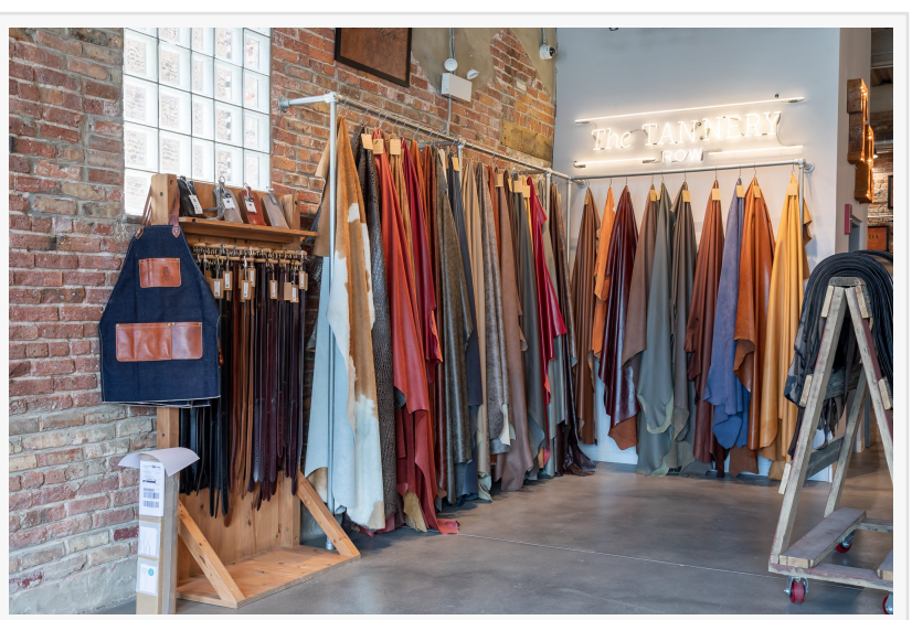
Inside The Tannery Row Showroom

From single leather sides to multiplepiece bundles, there are several options available at reduced prices that start as low as $100 (for a single side).