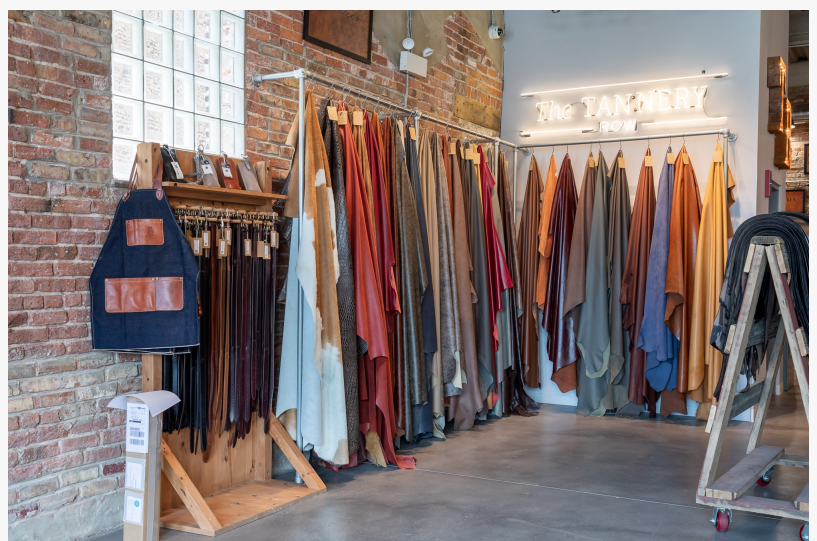
Inside The Tannery Row Showroom

Text subscribers will get early access to the leather sale, receiving codes at 9 a.m. CT on Nov. 21. Days before it's publicly available, these text codes will let subscribers take advantage of early