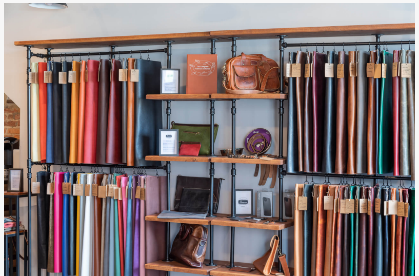
Leather Display at The Tannery Row Showroom