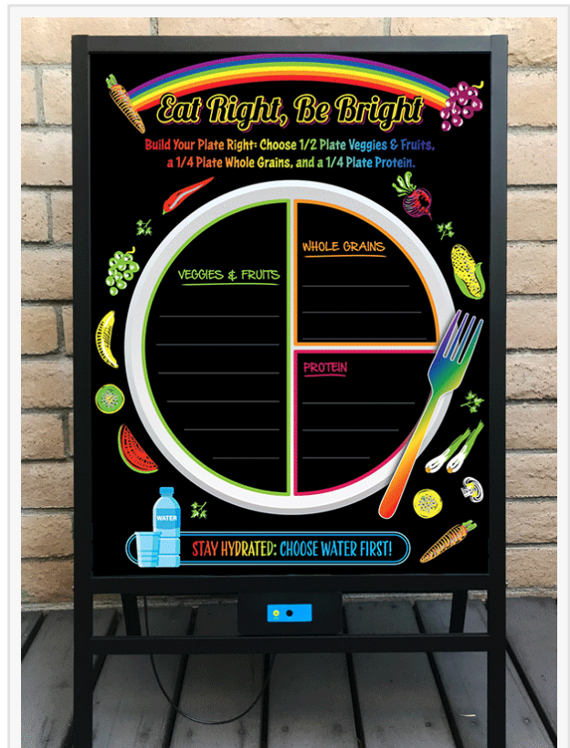
Canadian Plate Style Menu Board inside Stands

© 1995-2024 Newsmatics Inc. All Right Reserved.