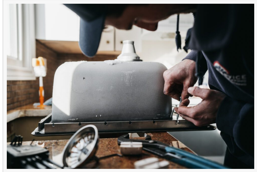
Plumbing Repair Services Saskatoon

Quick response times are essential during plumbing emergencies, where minutes can make the difference between minor inconvenience and major water damage. Pro Service Mechanical has implemented an advanced dispatch system that efficiently directs the nearest available technician to emergency calls. The company maintains strategically positioned service vehicles throughout Saskatoon, ensuring rapid response to any location within the service area.