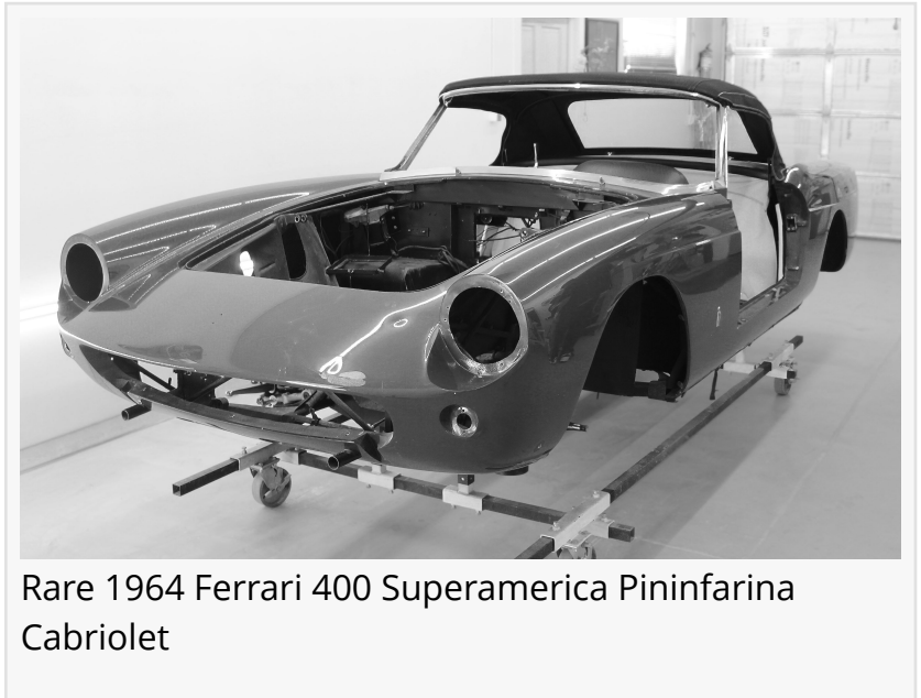
Rare 1964 Ferrari 400 Superamerica Pininfarina Cabriolet

EINPresswire.com/ -- In a remarkable fusion of luxury and philanthropy, The BASIC Fund, a nonprofit that funds school scholarships for low-income students and families, is completing the restoration of an extremely rare 1964 Ferrari 400 Superamerica Pininfarina Cabriolet (s/n 5093). It will be presented for public viewing and sale in 2025.