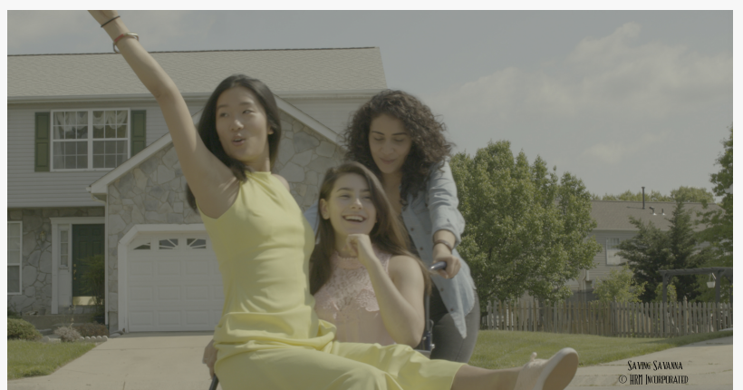
Still from 'Saving Savanna'