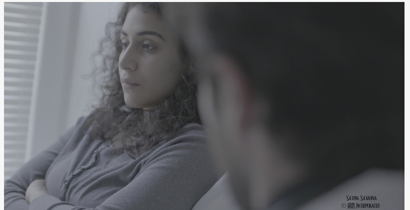
Savanna in the hospital

This press release can be viewed online at: https://www.einpresswire.com/article/760005037