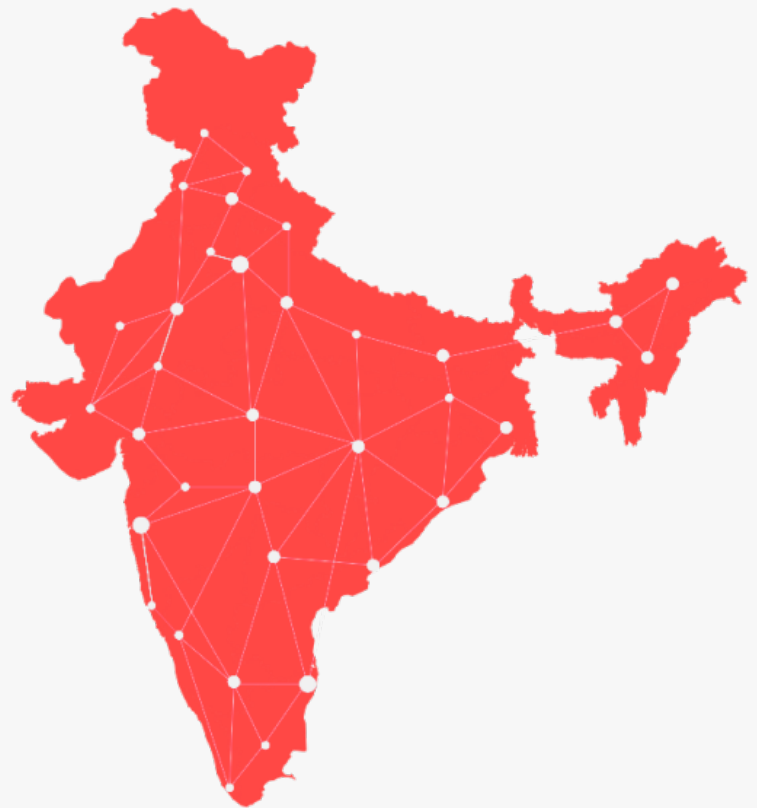
Pan India Network