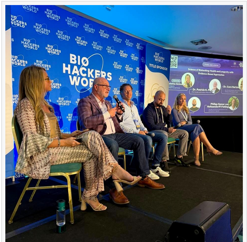
Biohackers World Conference Miami 2024

MIAMI, FL, UNITED STATES, October 31, 2024 /EINPresswire.com/ -- The Biohackers World Conference & Expo made waves in Miami this past weekend, drawing over 700 biohacking enthusiasts, wellness experts, and technology pioneers to the Miami Convention Center. The two-day event featured over 30 esteemed speakers, high-impact keynotes, and an impressive expo floor with over 40 exhibitors, marking the Miami debut as a landmark event for those passionate about human optimization and wellness innovation.