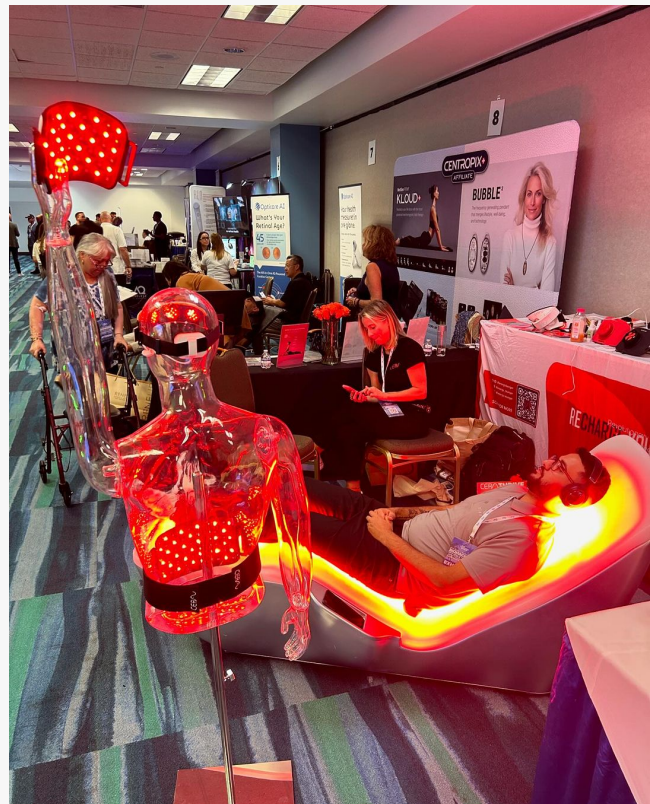
Biohackers World Conference Miami 2024