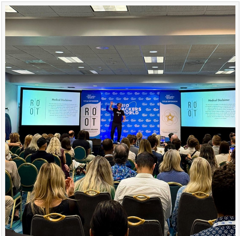
Biohackers World Conference Miami 2024