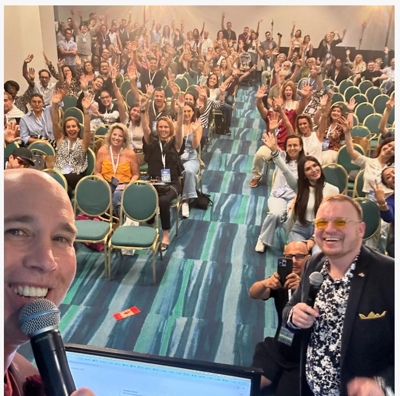
Biohackers World Conference Miami 2024

The day concluded with a grand giveaway, offering attendees the chance to win wellness gifts, showcasing the event’s commitment to promoting health and wellness.