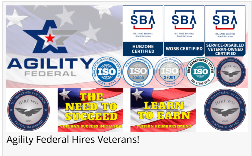
Agility Federal Hires Veterans!

PHOENIX, AZ, UNITED STATES, October 31, 2024 /EINPresswire.com/ -- U.S. Acting Secretary of Labor Julie A. Su recognized Agility Federal LLC as one of the 839 recipients of the 2024 HIRE Vets Medallion Award during a virtual award ceremony presented by U.S. Department of Labor 31 Oct 2024 at 1 PM EST.