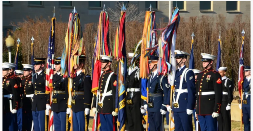
Agility Federal Salutes Veterans in the Workplace!