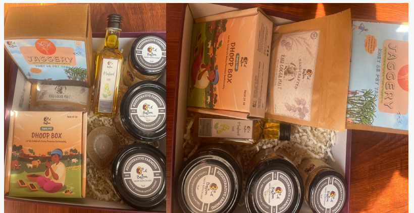
Diwali Organic Gifts