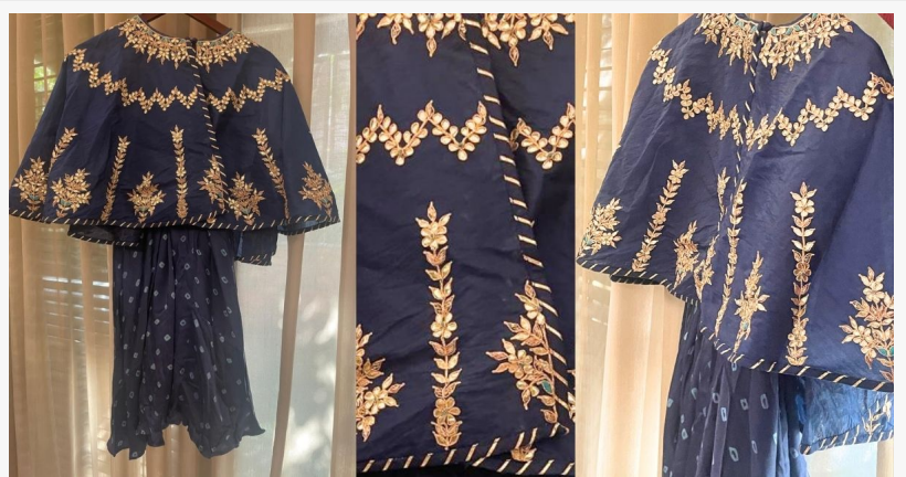
Diwali Dress for women

One of the major trends that is expected to take over Diwali 2024 is the use of eco-friendly decorations and products. With the growing concern for the environment, people are becoming more conscious of their actions and are opting for sustainable alternatives.