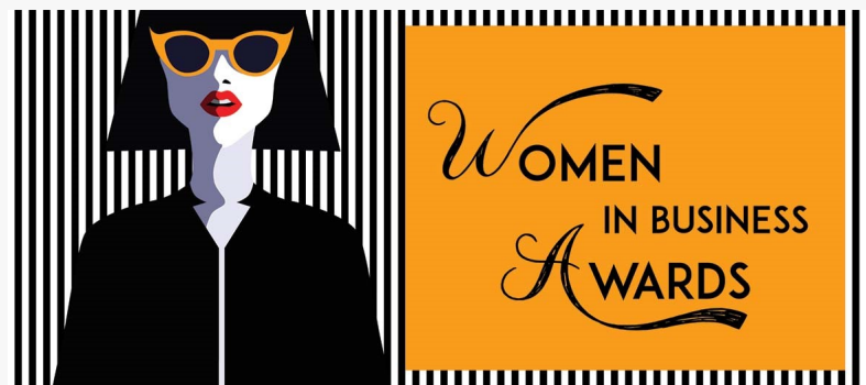
Women In Business Award