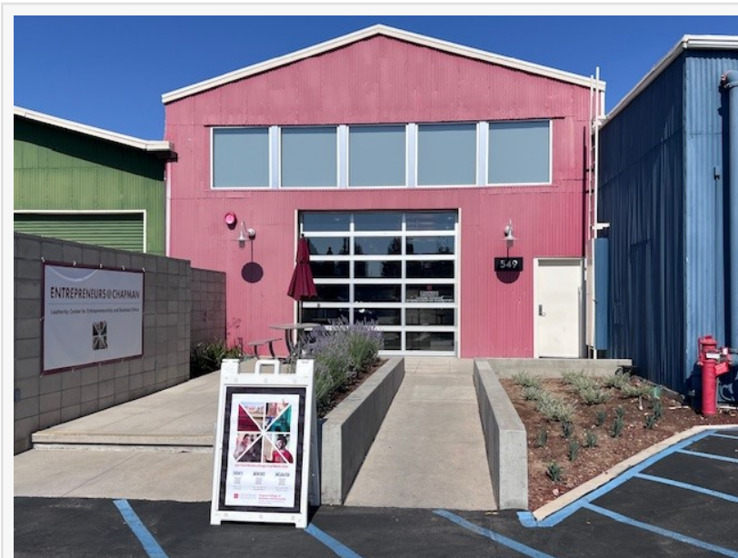
Leatherby Center for Entrepreneurship and Business Ethics Exterior