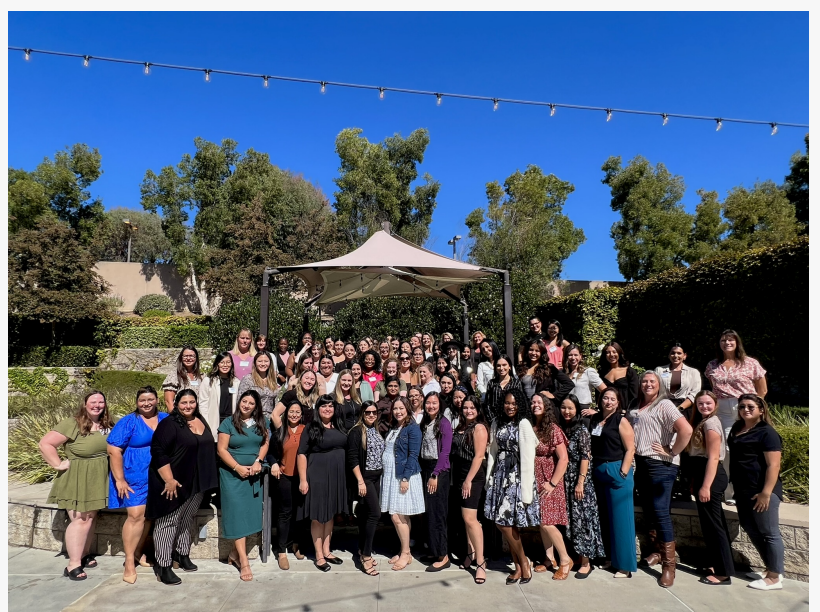
Women Rising Leadership Academy - Advancing Women's Careers