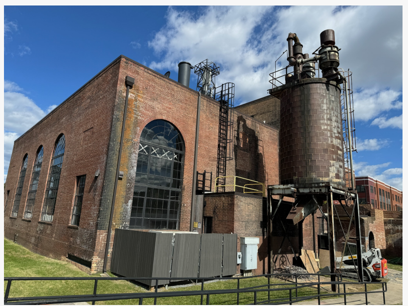
The Power Plant at Liberty