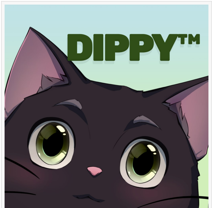
Dippy AI logo.

The Dippy iOS and Android censorship-free, filter-free app and web product has garnered 500,000 monthly users since being quietly introduced in April. Users have created 30,000+ different characters in the one month this feature has been enabled. The proactive and