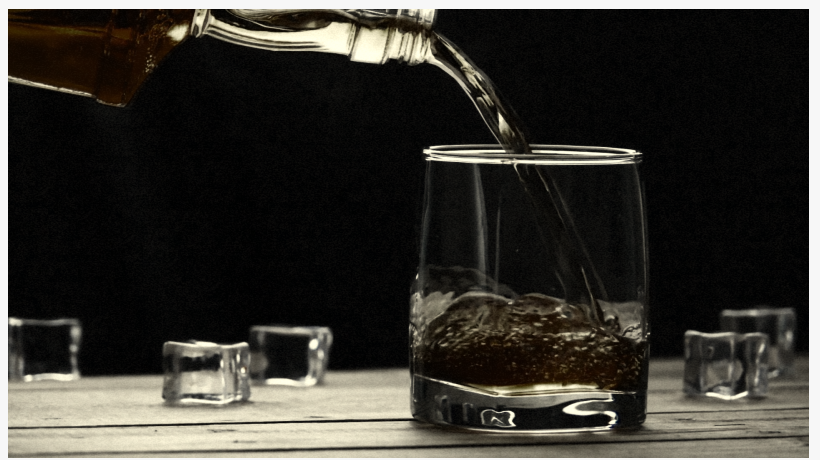
Desert Diamond Distillery Rum

Desert Diamond Distillery's use of molasses instead of white sugar or sugarcane juice makes its rum more aligned with the traditional ways of centuries past from exotic locales like the Caribbean, Central America, and South America, where molasses has been used for centuries for their local rums.