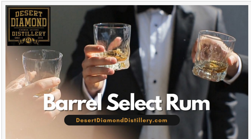
Desert Diamond Distillery Barrel Select Program

Participants in the Barrel Select Program visit the distillery to experience a mentored tasting of a selection of barrels in the barrel room. They will choose a barrel with the unique flavors they enjoy the most, putting their own distinctive fingerprint on this unique gift.