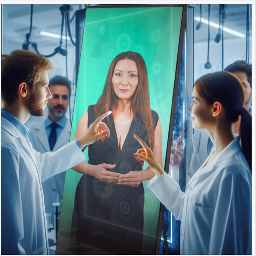
Step into the future of healthcare! Join us at the International Conference of Integrative Oncology, October 25-27, 2024, and witness groundbreaking AI innovations in personalized health.

Al-Powered Educational Platform The event highlights Al Wellness' innovative educational platform, using Al-powered digital avatars to deliver personalized wellness education and health recommendations. This platform is set to redefine the future of healthcare learning and patient engagement.