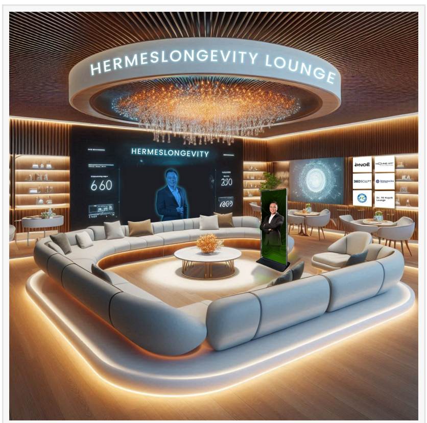
Experience the future of wellness at the HermesLongevity Lounge! Join us at the International Conference of Integrative Oncology, October 25-27, 2024, where innovation meets luxury.

For more information, please visit <u>https://aiwellness.ai/city-of-hope</u>.