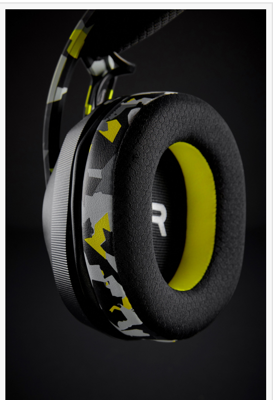
WC PadZ ear cushions