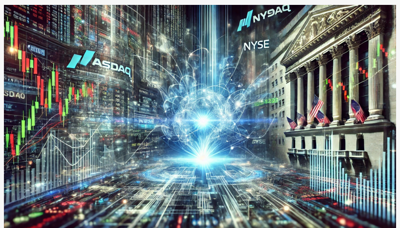
AI-driven news sentiment analysis process

LUXEMBOURG, LUXEMBOURG, October 8, 2024 /EINPresswire.com/ -- Building on the success of previous trials, Bifin AI is excited to announce the launch of its final, large-scale test aimed at predicting stock price movements using AI-driven news sentiment analysis across the NASDAQ, NYSE, and NYSE American exchanges.