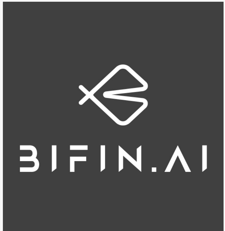
The sleek black logo of Bifin Sàrl, symbolizing our commitment to blending tradition with cutting-edge AI technology.