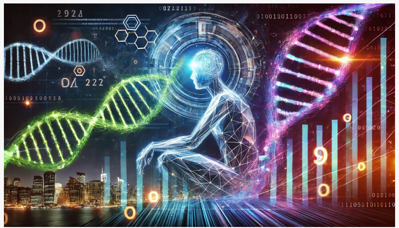
The Intersection of AI and Stock Markets

Bifin AI's platform, Silk, complies with the EU AI Act requirements for minimal and low-risk AI systems, ensuring transparency and adherence to relevant standards. We continuously monitor regulatory developments to keep our practices up-to-date. Our equity investment discussions are strictly private and involve venture capital engagements, fully aligned with applicable laws. Bifin AI follows EU Anti-Money Laundering (AML) directives and GDPR standards, ensuring secure