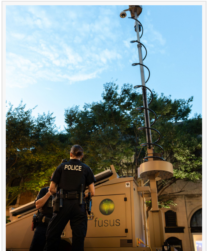
Dejero GateWay onboard a FUSUS/Compass Security Solutions mobile surveillance trailer equipped with hi-res cameras at a crucial area in downtown Winston-Salem

Powered by Dejero Smart Blending Technology™, GateWay is certified by multiple nationwide US wireless communications networks built for priority-use of first responders and the public safety community. Smart Blending Technology combines connectivity from diverse cellular and other IP network providers, including LEO, MEO and GEO satellites creating a virtual 'network of networks' to provide access to a far greater coverage area than any single provider can deliver. Easily transported, GateWay can be set up in a matter of minutes, making it ideal for on-location events.