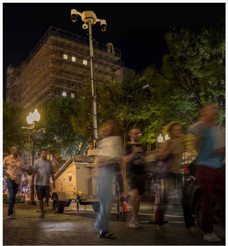
Dejero GateWay onboard a FUSUS/Compass Security Solutions mobile surveillance trailer equipped with hi-res cameras at a crucial area in downtown Winston-Salem

This press release can be viewed online at: https://www.einpresswire.com/article/749732424