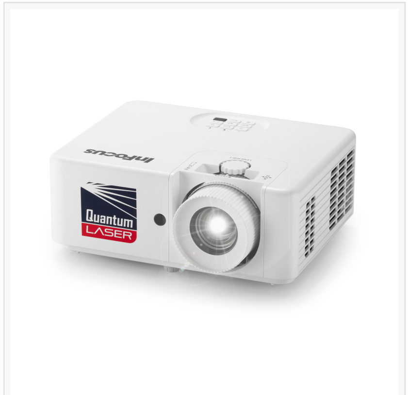
Newly launched InFocus Quantum Laser Series Nemesis II offers incredible visuals for businesses and large spaces projection

Developed with DLP™ technology, the Nemesis II Series projectors boast an incredibly long