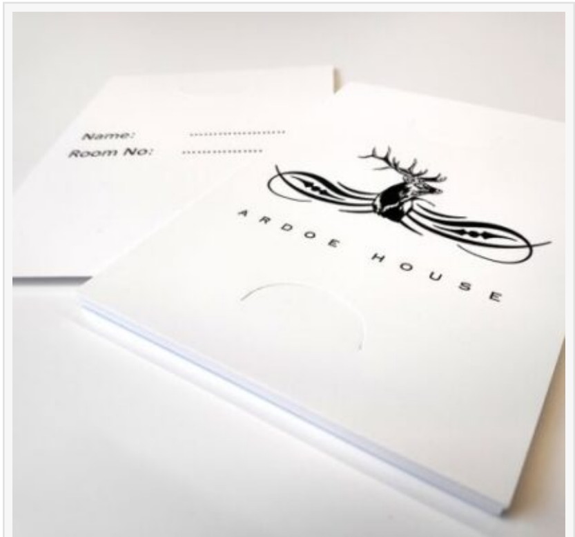
Access Made Easy, Sleek, and Chic, Elevate Your Everyday with a Unique Peak

The newly launched Order Management Tool represents a revolutionary step in customisation within the key card holders sector. In an era where personalisation is key to brand engagement, this tool allows businesses to create products that truly reflect their brand identity.