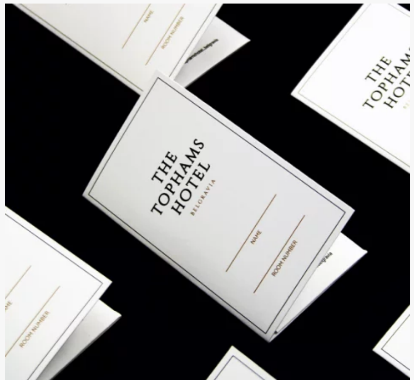
Fold it up, take it out with ease, Elegance meets practicality to please