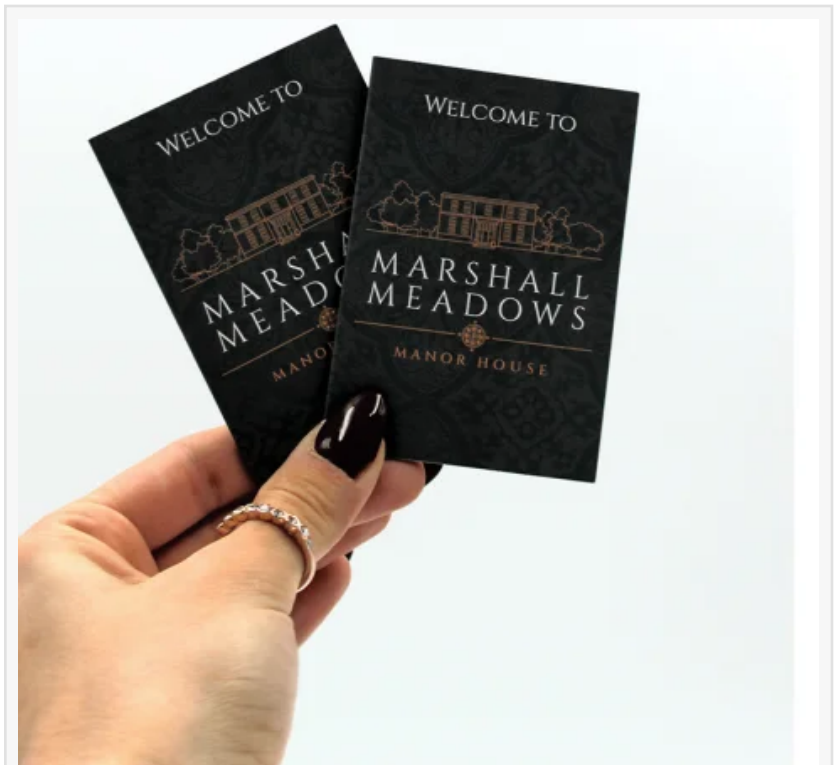
Pocket-Sized Convenience at Your Fingertips, Carry Your Essentials with Effortless Ease