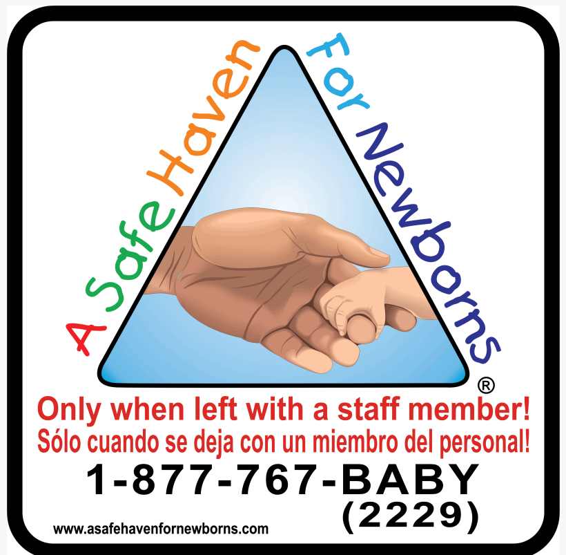
A Safe Haven for Newborns Signage designating hospitals, fire and EMS stations as Safe Haven.