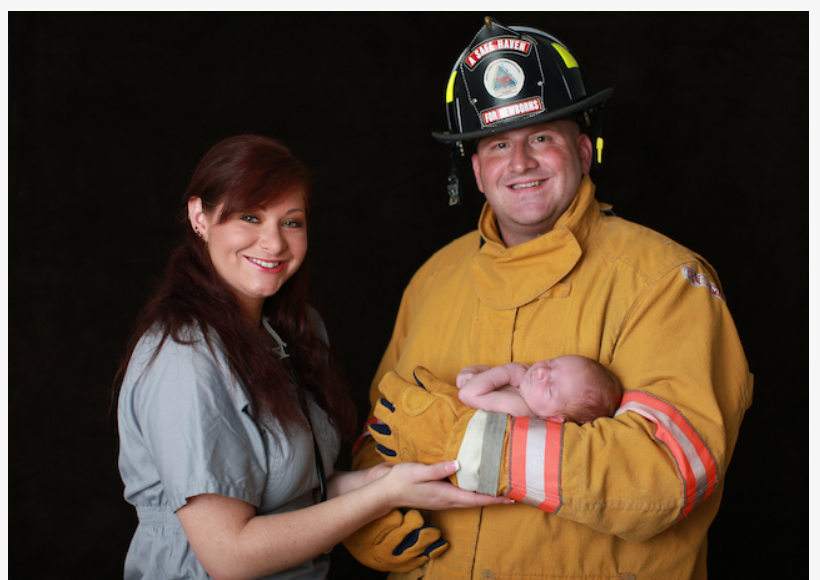
Newborn safely surrendered in caring arms

Nick believed from the beginning 23 years ago, "If we saved only one life all of our efforts will be