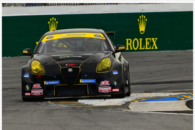
TMR-KMW Motorsports Rolex Daytona