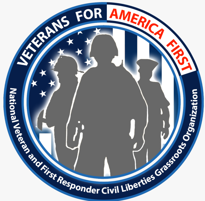
Veterans for America First official logo VFAF.US

The reuniting of the groups occurred after Veterans for America First was asked to participate in the Trump campaigns Veterans for Trump coalition zoom with Vets for Trump chair Congressman Brian Mast on 9-26-24. https://vfaf.us/vfaf-joined-trump-campaign-vets-coalition-zoom-working-with-rep-brian-mast