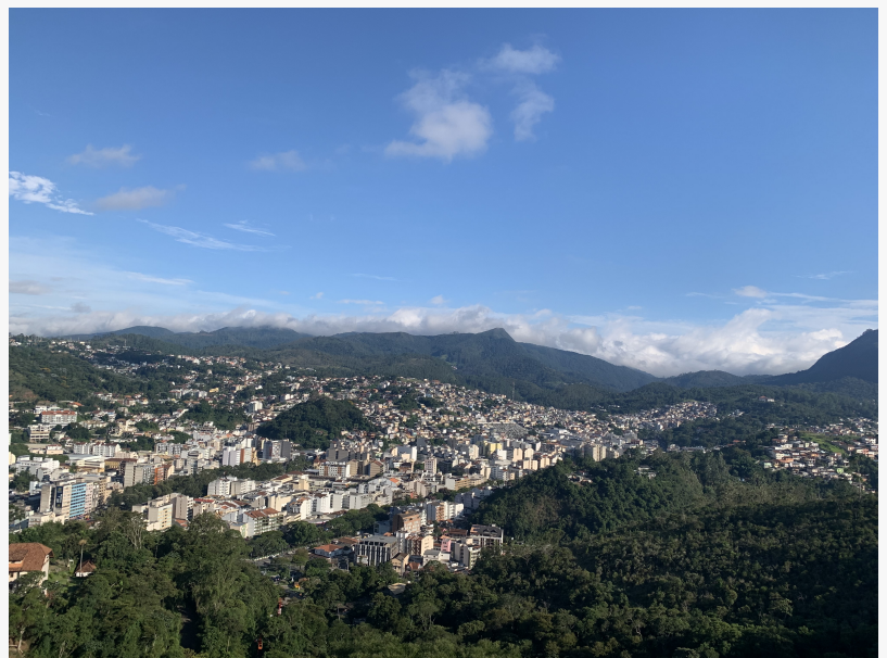
Downtown Nova Friburgo

Nova Friburgo has the biggest forest coverage in the Atlantic Rainforest, the least preserved of