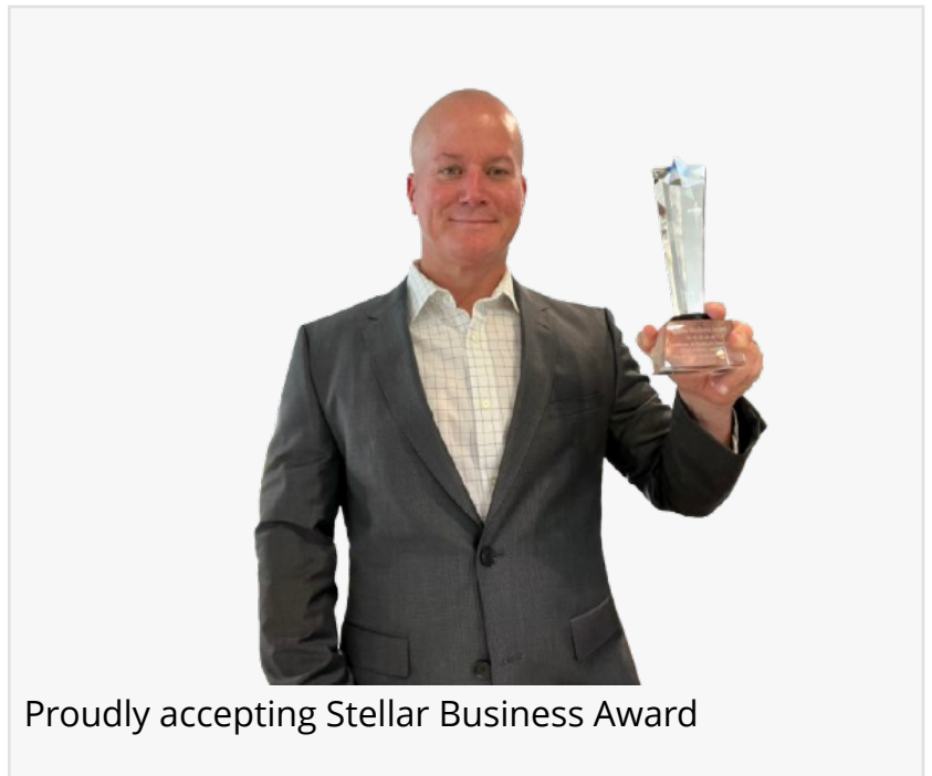
Proudly accepting Stellar Business Award

This press release can be viewed online at: https://www.einpresswire.com/article/746170959